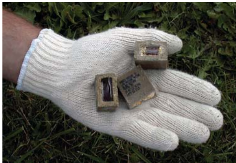
Oral rabies vaccination bait, like that pictured above, is distributed each year to prevent rabies in wildlife, such as raccoons, coyotes, and foxes.

Results from analyses such as these provide an economic basis for decisionmaking and serve as a guide for future ORV baiting campaigns in the United States and other countries. Today, State and Federal wildlife ORV programs are faced with declining resources. Ironically, as these resources shrink, societal and environmental changes are leading to increased opportunities for people and pets to be exposed to wildlife, particularly in urban and suburban environments. Progress has been made towards eliminating rabies in terrestrial wildlife, but continued coordinated efforts are still needed. The successful elimination of rabies from the United States relies on preventing the disease in wildlife.