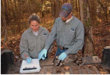
USDA-APHIS-WS wildlife biologists work to reduce rabies in wildlife through oral rabies vaccination programs, as well as surveillance and monitoring efforts.

as raccoon populations are present in all 48 States. While raccoon vaccination is the largest of WS' efforts, the program has also been involved in a cooperative ORV operation in Texas that targets canine rabies in coyotes and a unique variant of the disease in gray foxes. In Arizona, projects focus on foxes and on free-ranging dogs on Tribal lands.